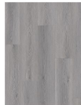
Luna Grey XL