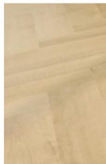
H02- Limed Ash