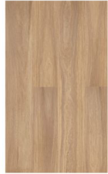
NSW Spotted Gum